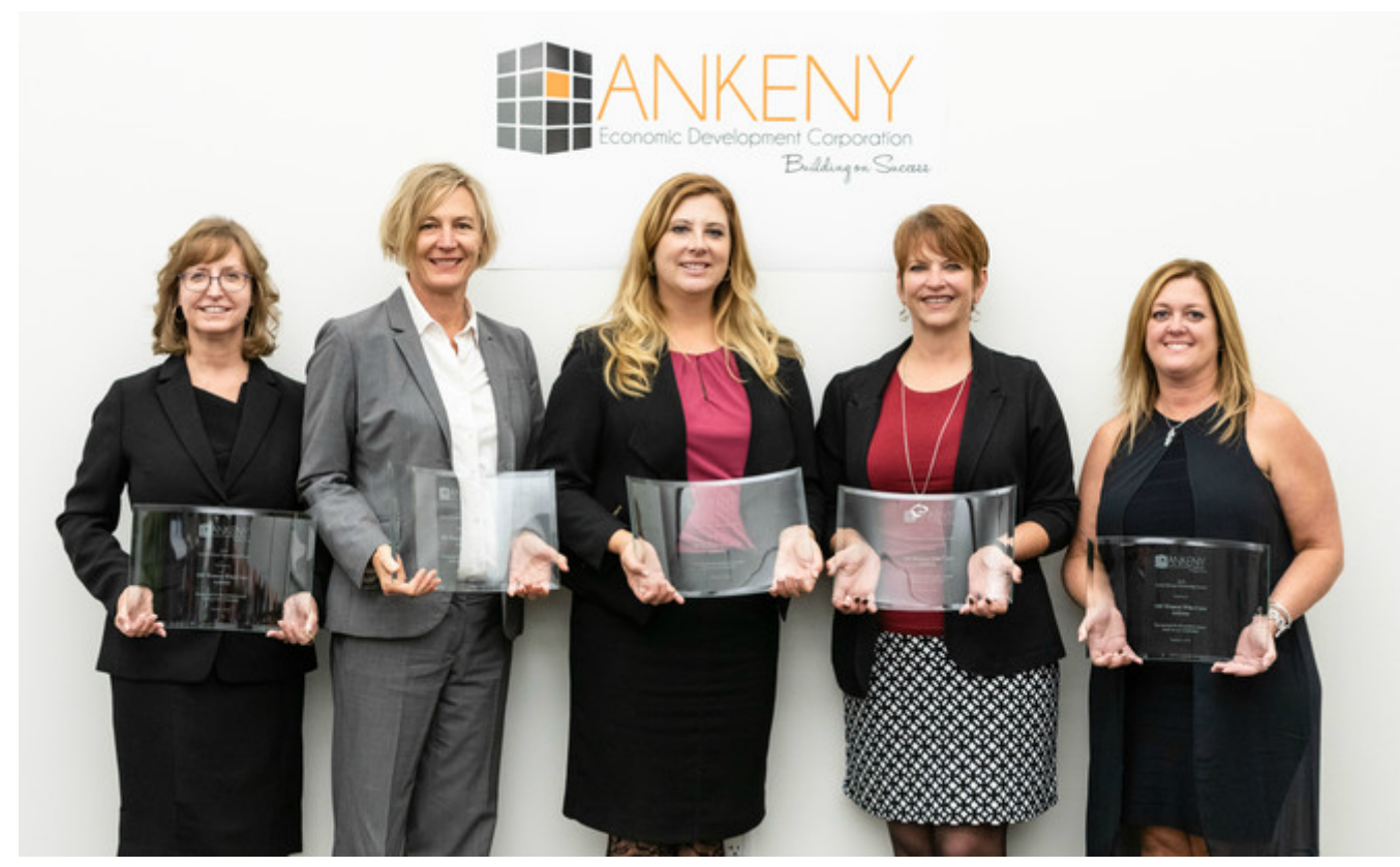
Founders of 100 Women Who Care Ankeny

Salute to Industry | Ankeny Economic Development Corporation